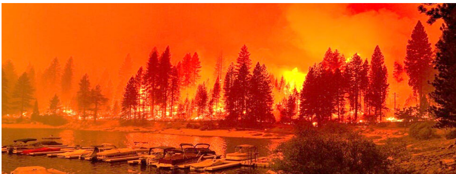
Creek Fire 2020

Situational Awareness is an Important Safety Skill at Work