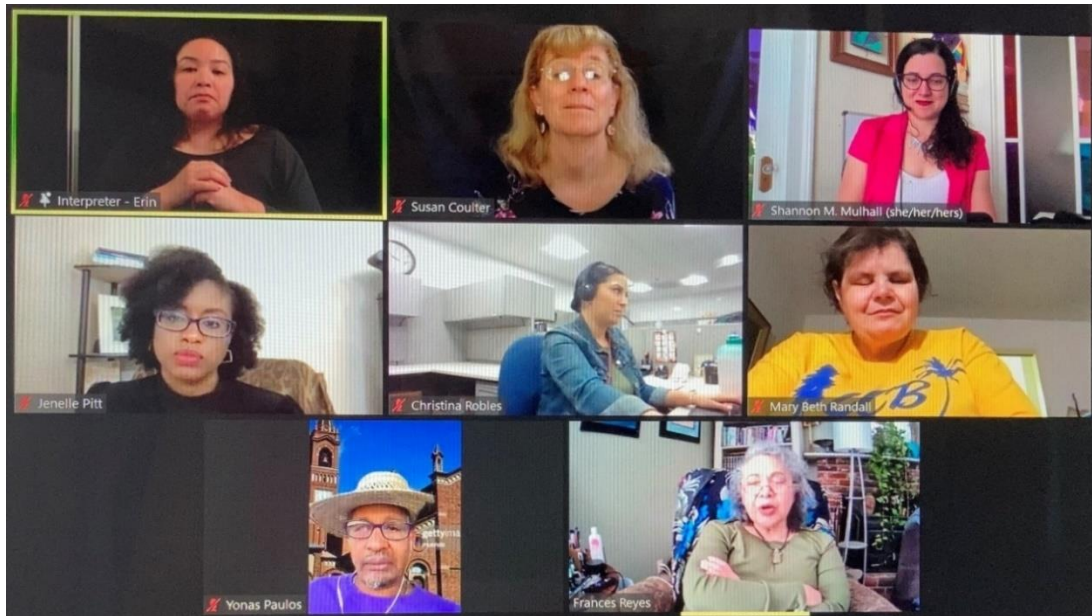
The photograph above shows members of the Disability Advisory Commission (DAC) meeting via Zoom.