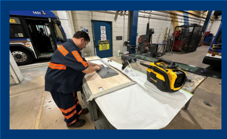
Working in 35 degree weather!