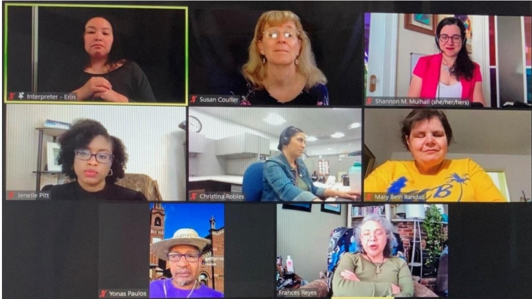
The photograph above shows members of the Disability Advisory Commission (DAC) meeting via Zoom.