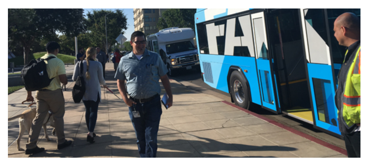
The FY2019/20 Unmet Transit Needs Process and Short Range Transit Plan are now complete

invited to board FAX's most modern buses and share with staff how they experience transit on FAX. Staff learned first-hand about the many obstacles that affect transit riders with disabilities and will use this feedback to help improve their transit experience on future buses purchased.