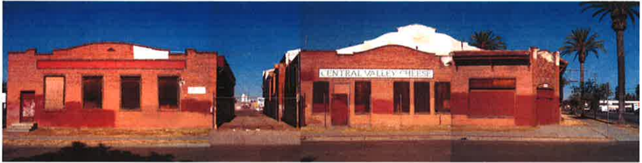
Photo above, Roosevelt Streetscape composite, courtesy of Kiel Schmidt.

Roosevelt Avenue elevation and features a prominent espadaña (curvilinear parapet) painted out in white. A circle on the center of the parapet is empty but may once have included a terra cotta ornament or emblem for the business. The north and south elevations of the complex are reinforced with stout pier buttresses of brick. A hefty bond beam runs along the Belmont Street façade. The rear of this building has cement cladding with a deep open section on the south corner for loading. A faded sign, "Central Valley Cheese" is still visible.