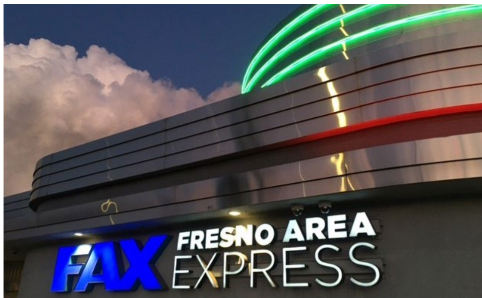
The Christmas lights on Manchester Transit Center.

As we come to the end of what has been a second year of living in a pandemic, FAX wishes you and yours a happy, healthy, and safe holiday season. We extend deep gratitude to our passengers for wearing masks and social distancing on our buses. Thank you to all our passengers for your patience as we adjust to what has become the “new” normal. In addition, FAX thanks our