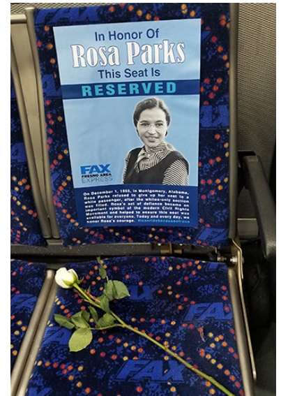
Commemoration of Rosa Parks placed on FAX buses on December 1, 2022

In honor of Rosa, and observance of Rosa Parks Day, on Wednesday, December 1, 2021, a reserved sign and a single white rose were placed on the front seat of every FAX bus.