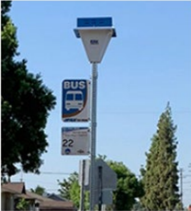
The Solar Bus Stop Lights being deployed throughout the FAX fixed-route network.

Work has begun on Phase 2 of the Bus Stop Solar Lighting project. The project is set to install 95 shelter-mounted and 52 pole-mounted lighting units. There have been 50 units installed so far through the first weeks of the project. The pole-mounted units come with a button to help activate a brighter lighting mode while waiting at the stops in the twilight/night hours. FAX's goal with these installations is to make our stops safer and prevent missed pickups in low-light situations.