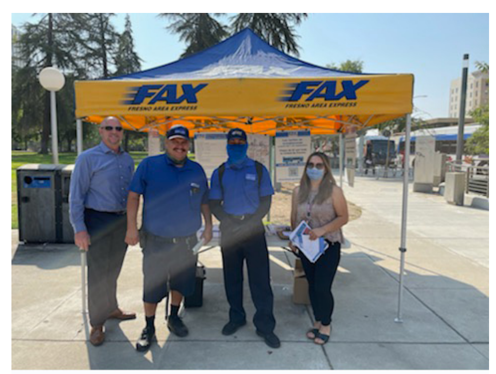
FAX Planning staff with FAX bus drivers at a recent fare structure public outreach event.

FAX recently completed an extensive public outreach process to inform FAX transit riders about the new fare structure and solicit feedback for the Title VI fare equity analysis.