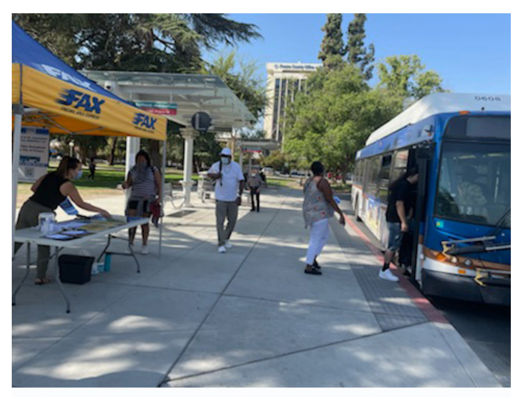
A FAX public outreach event at Courthouse Park for the Fare Structure project.

FAX is subsidized in part by the Federal Transit Administration (FTA). As a result, FAX works with the FTA's Office of Civil Rights to ensure that service and fare changes do not result in disparate impacts or disproportionate burdens for minority low-income and populations. The results of our fare equity analysis will be included in our Title VI