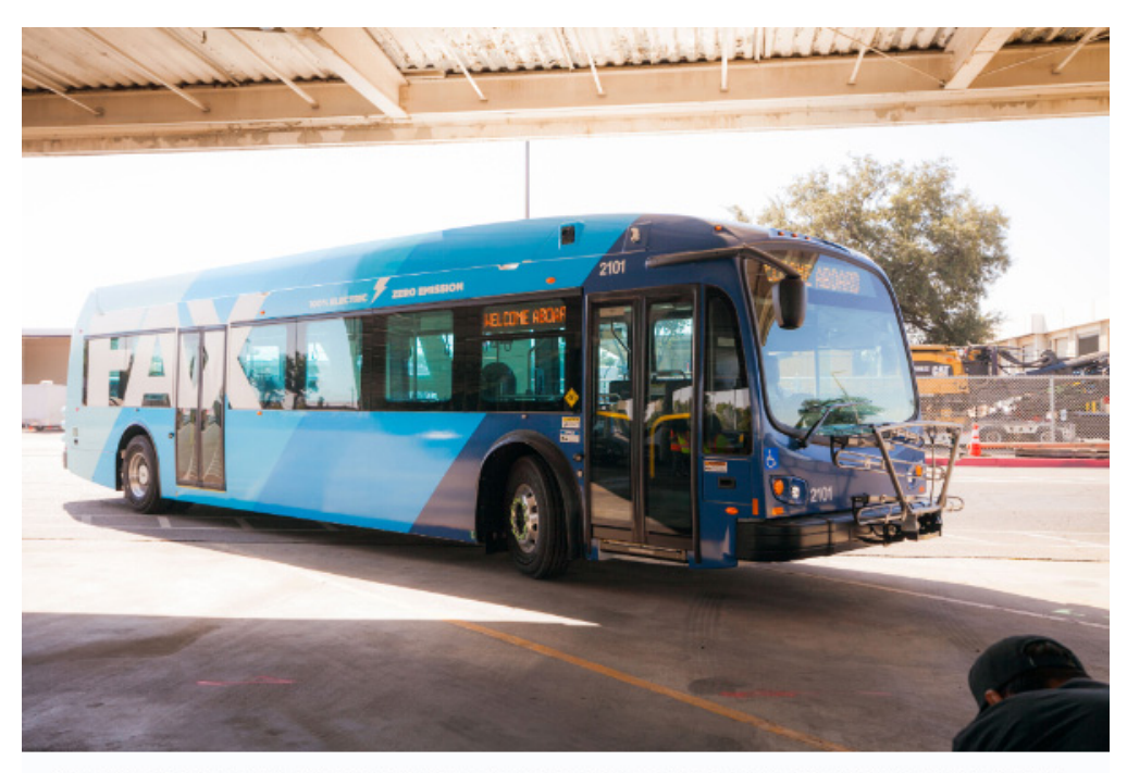
The first of several FAX electric buses drives into a recharging bay at the operations yard for the City of Fresno

As you can imagine, the transition to electric does not come cheap. This project is made possible through the Federal Transit Administration (FTA), and the State of California Transit Intercity and Rail Capital Program grants. Additional support is coming from PG&E's Electric Vehicle (EV) Fleet program in the form of infrastructure to support the 3 MW load and also other financial incentives to purchase electric buses and bus chargers.