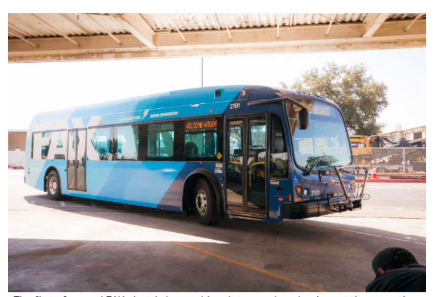
The first of several FAX electric buses drives into a recharging bay at the operations yard for the City of Fresno.

other financial incentives to purchase electric buses and bus chargers.