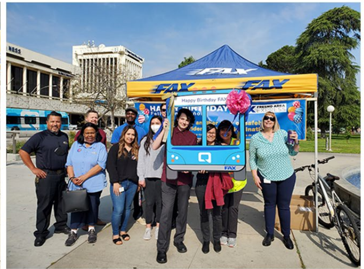
FAX staff working at the 'FAX Turns 60' event at Courthouse Park on March 30, 2022. Staff from the City of Fresno Planning Department presenting FAX staff with a FAX bus decoration that they made.

We are proud to serve you! Thank you for riding FAX and we look forward to our 75 th Birthday celebration.