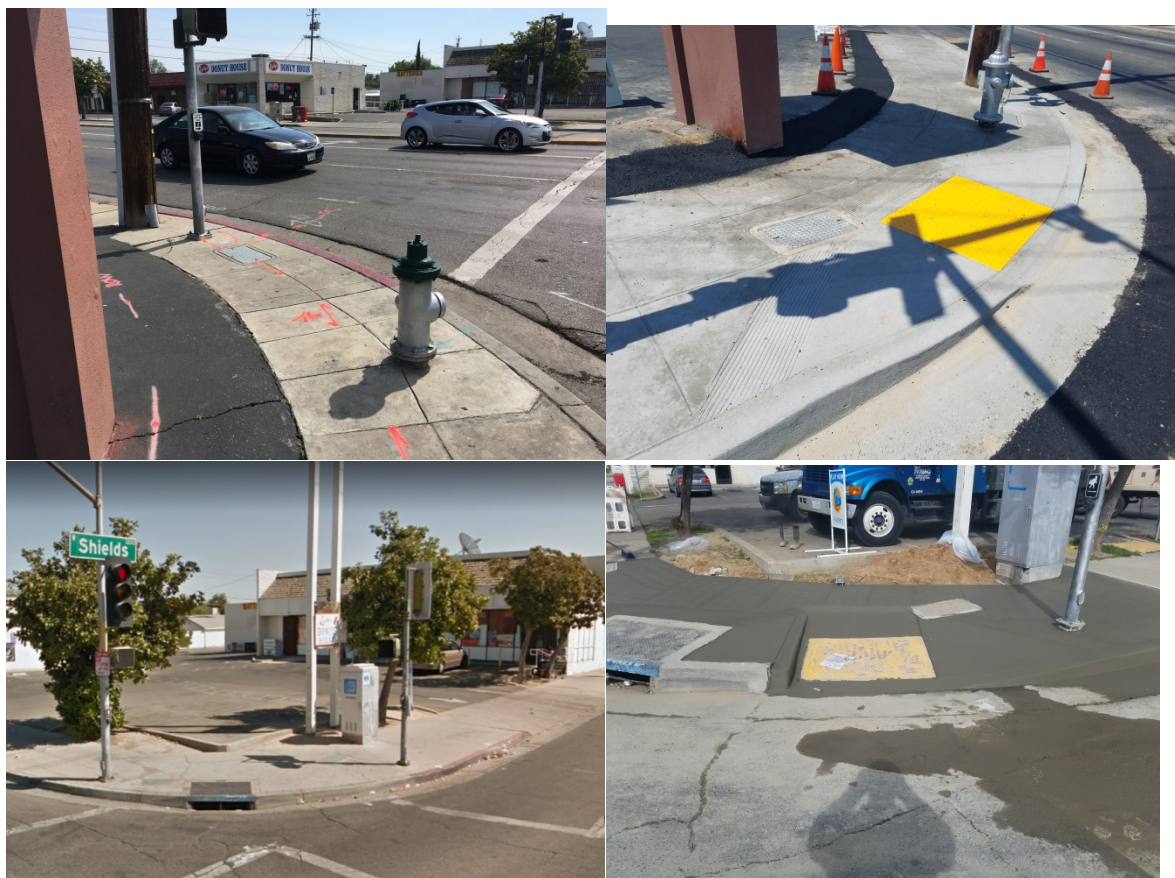
Picture 7: Shields and West Intersection posed many challenges for accessibility.