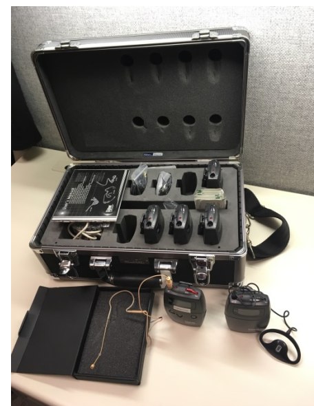
Picture 8: FM Systems are available for enhanced communication access.