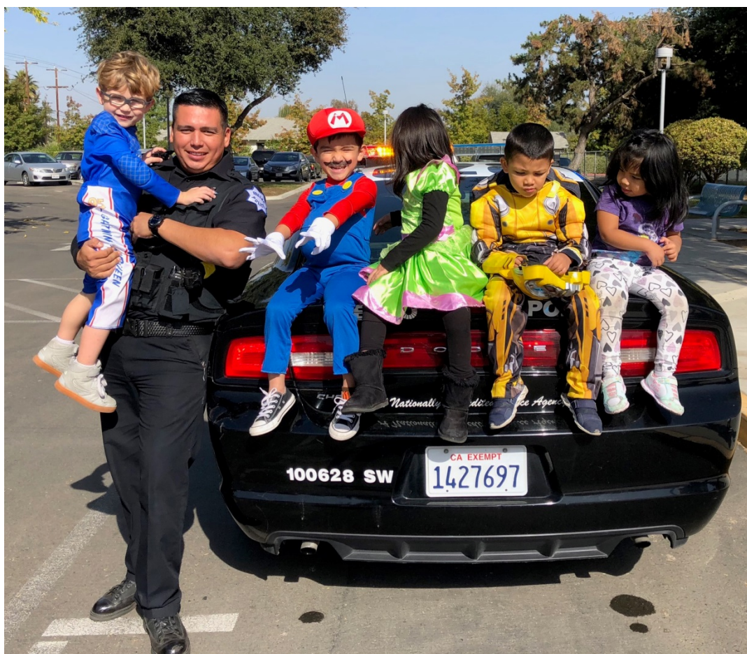
Picture 9: Officers attended a Halloween celebration at Beth Ramacher Developmental Center. The department makes efforts to build positive relationships within the community.

“T” or telephone coils can switch them on and receive signals directly to their hearing aid. Those without “T” coil equipped hearing aids can use a receiver. The City Clerk’s Office has a portable FM System which is not equipped with the individual loop system however it is compatible with individual loops that may be obtained from the office of the ADA Coordinator.