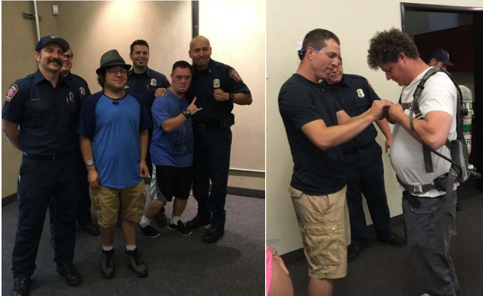
Picture 16: During a round table discussion VPCI participants and Fire Fighters had an opportunity to get to know each other better, including testing out fire equipment.

Center, and NorCal Services for Deaf and Hard of Hearing.