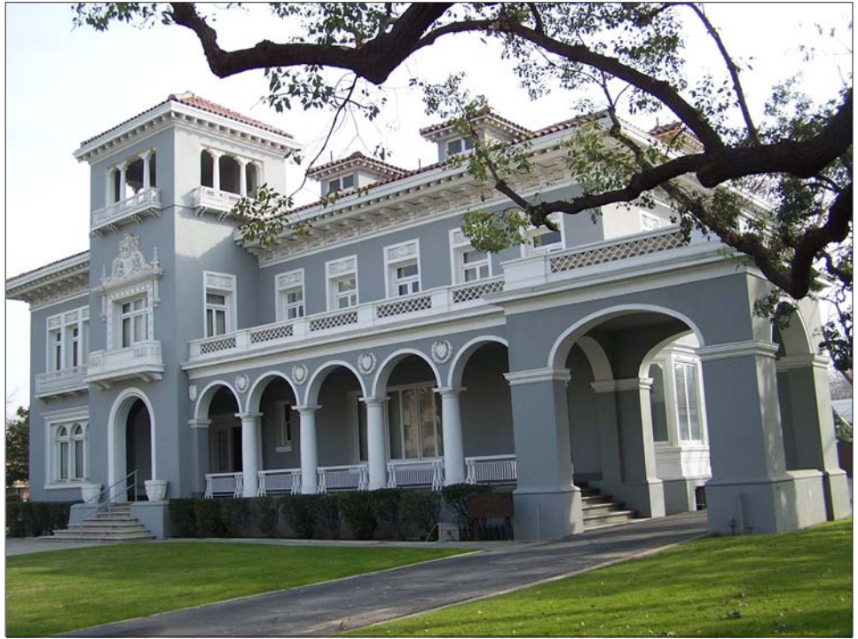
H.H. BRIX MANSION (1911, EDWARD T. FOULKES, HP#089, NATIONAL REGISTER PROPERTY)

THE NEVINS ADOBE (1920-1947; FIG GARDEN)