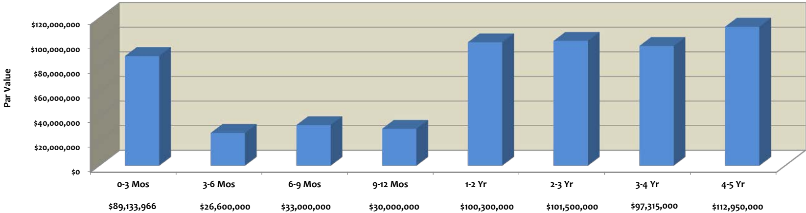
Maturity Distribution December 31, 2019