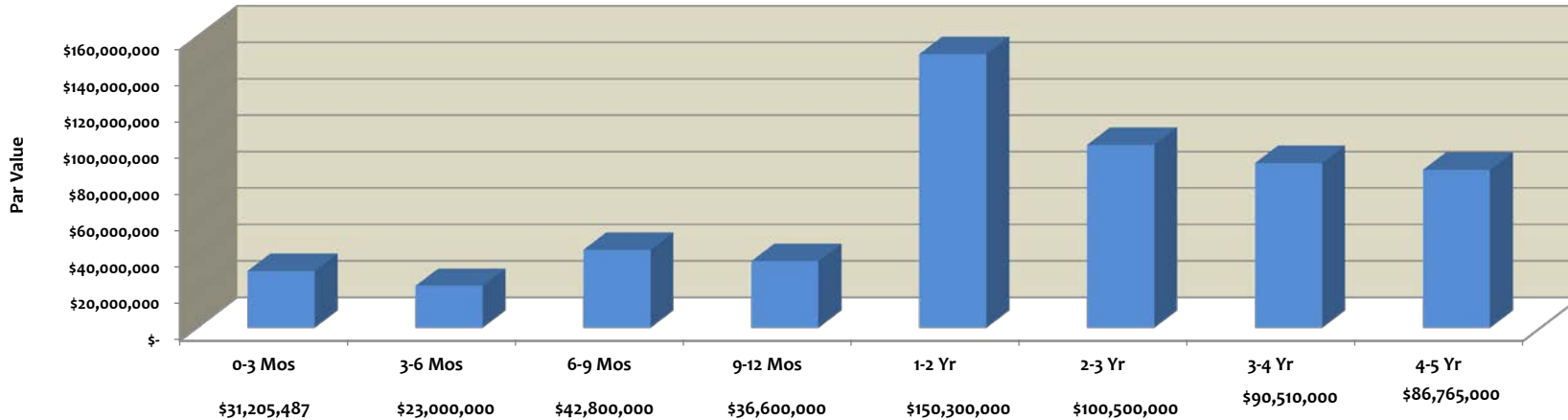
Maturity Distribution June 30, 2019