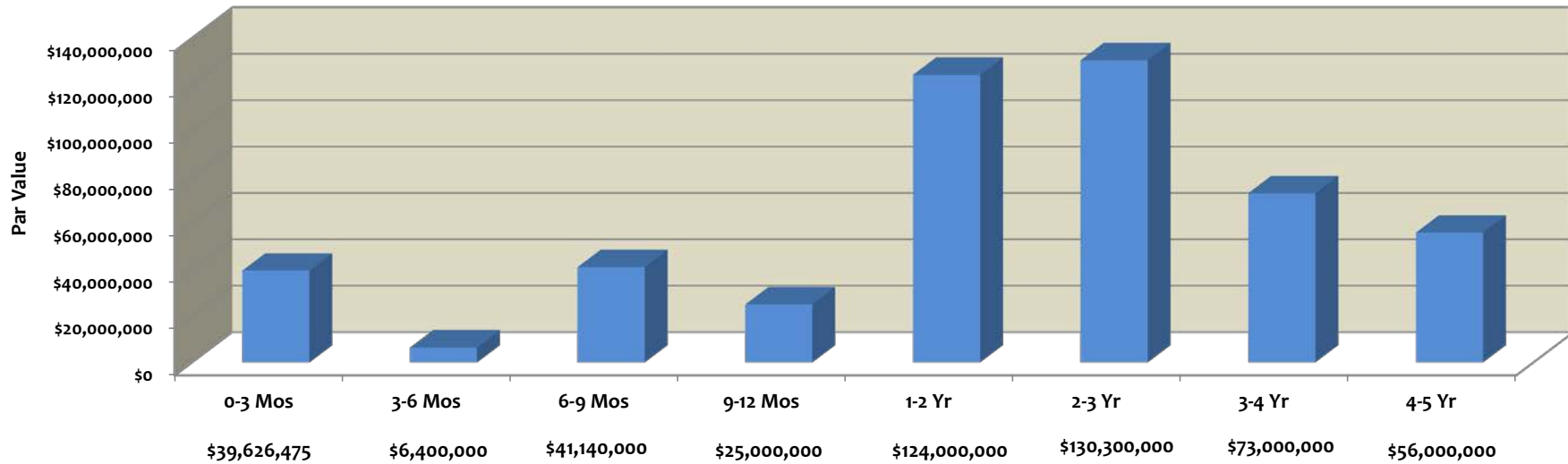
Maturity Distribution August 31, 2018