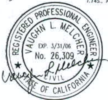
EXHIBIT "B" PUBLIC UTILITY EASEMENT MARCH 15, 2005

BLAIR, CHURCH & FLYNN CONSULTING ENGINEERS 451 CLOVIS AVENUE, SUITE 200, CLOVIS, CA 93612 TEL. (559) 326-1400 FAX. (559) 326-1500