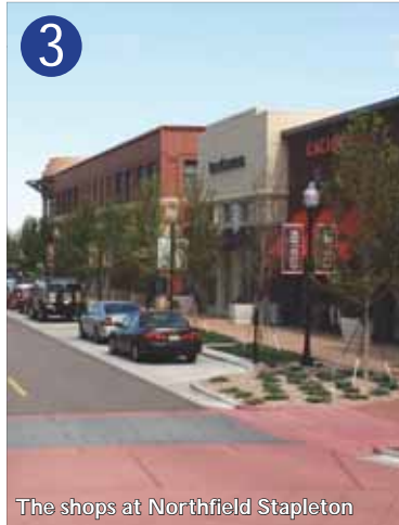
The shops at Northfield Stapleton