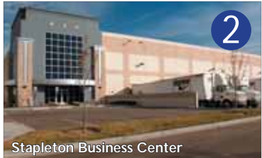
Stapleton Business Center