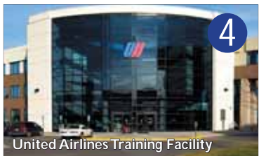
United Airlines Training Facility