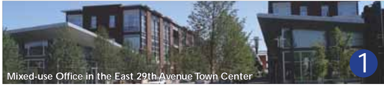
Mixed-use Office in the East 29th Avenue Town Center