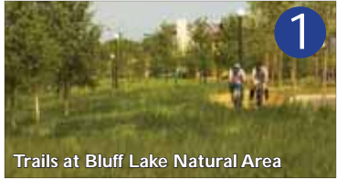
Trails at Bluff Lake Natural Area