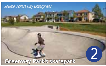
Greenway Park's skatepark